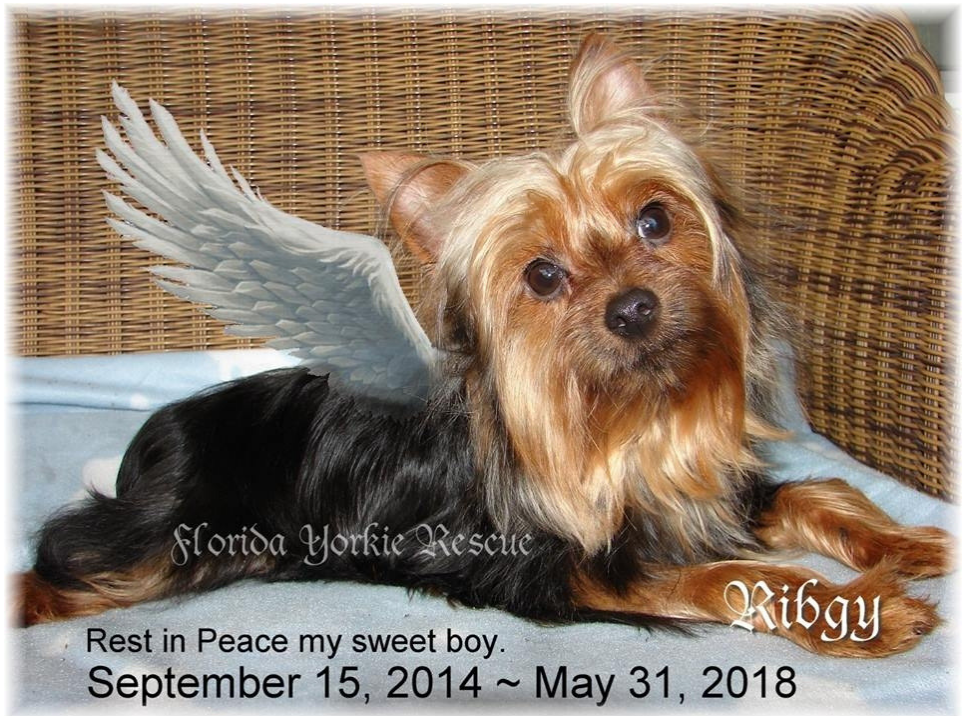
Rest in Peace my sweet boy. September 15, 2014 ~ May 31, 2018

Yorkies leave paw-prints forever on your heart!